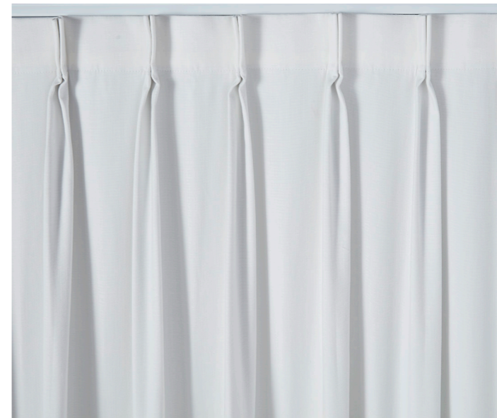
Double Pinch Pleat